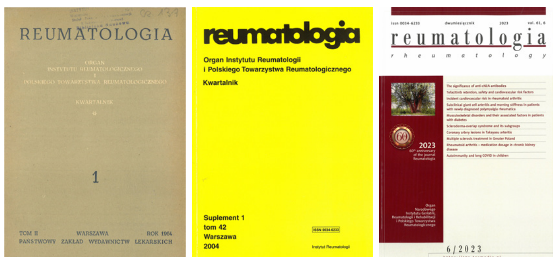
Covers of the journal Rheumatologia in the years 1964, 2004, 2023.

Reumatologia was fortunate to enjoy the involvement of many talented and dedicated individuals in its development – and this is especially true for its current Scientific Board, consisting of excellent scientists and clinicians from several countries. Reumatologia cooperates with national and foreign reviewers and editors, who not only commit their professional skills, but also support our journal on social media platforms.